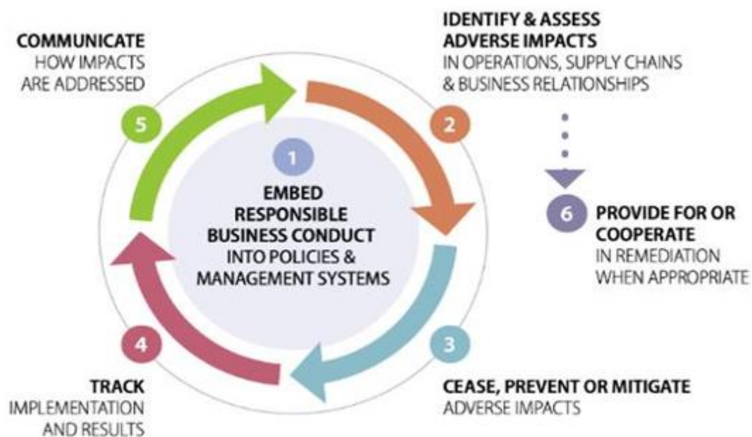
FIGURE 1. DUE DILIGENCE PROCESS & SUPPORTING MEASURES

Source: Figure 1: OECD (2018) OECD Due Diligence Guidelines for Responsible Business Conduct